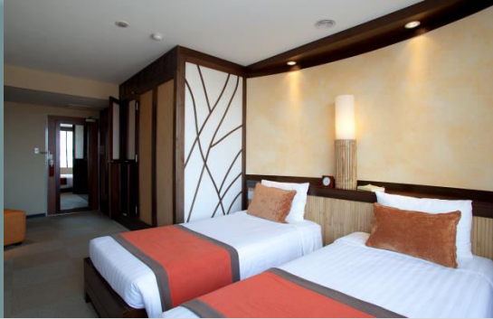
CLUB ROOM with Tatami Lounge