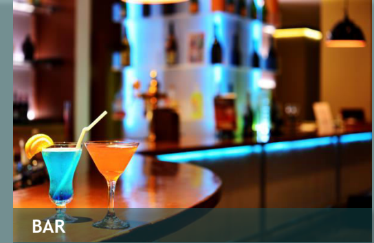
WAKKA BAR Main bar