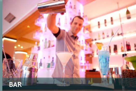
MINA MINA Specialty Restaurant