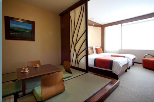
DELUXE ROOM with Tatami Lounge