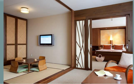
SUITE with Mountain view