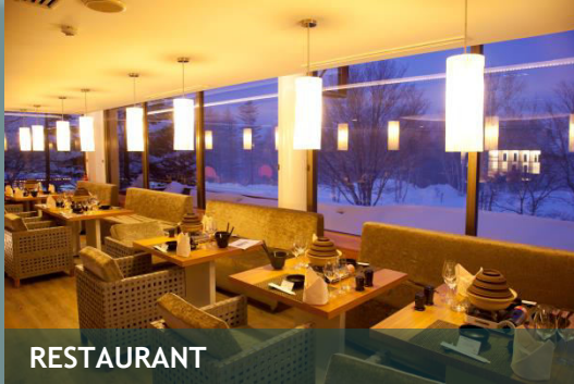
DAICHI Main Restaurant