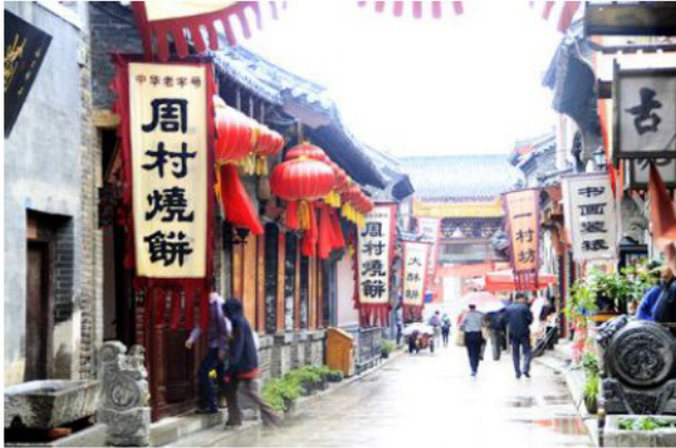
Zhoucun Old Town , under the administration of Zibo City of Shandong Province, holds the reputation as the "birthplace of Shandong commerce."

Known as the "dry port" for its strategic location along many overland trading routes, trade in Zhoucun flourished in the early 20th century, and it became an important center for bankers and well as silk and tobacco merchants.