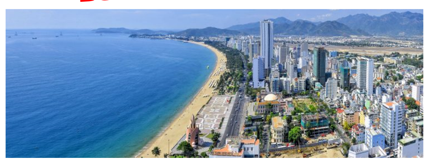
BOOKING PERIOD: FEB - DEC 2020 TRAVEL PERIOD: FEB - 31 DEC 2020